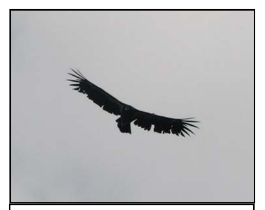
Soaring California Condor

Not many North American birders can seriously say that they have not heard of California Condors.