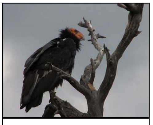
California Condor

We set off down the trail to find the cave paintings that the cashier had told us about. We found them. They were hidden because of vandalism. The trail is a three-day trail, so we walked about a half of a mile in and went back up. We walked a little bit more of the Rim Trail, and set off for our rental. However, from the transport bus, we saw a dark shape in the tree. We got out at the next stop, and I raised my bins. Yep, a pink head. It was a California Condor in a tree.