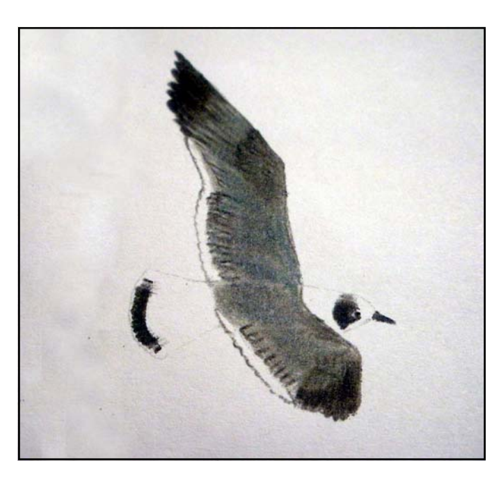
First winter Franklin's Gull