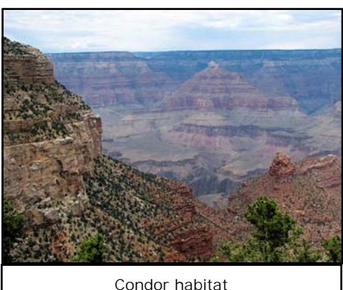
Condor habitat By Sarah Winnicki

All birds face habitat loss and destruction. Golden Eagles compete with the less aggressive condors for food and habitat, often with horrifying results. Power lines, hazards to all large birds, zap condors every year.