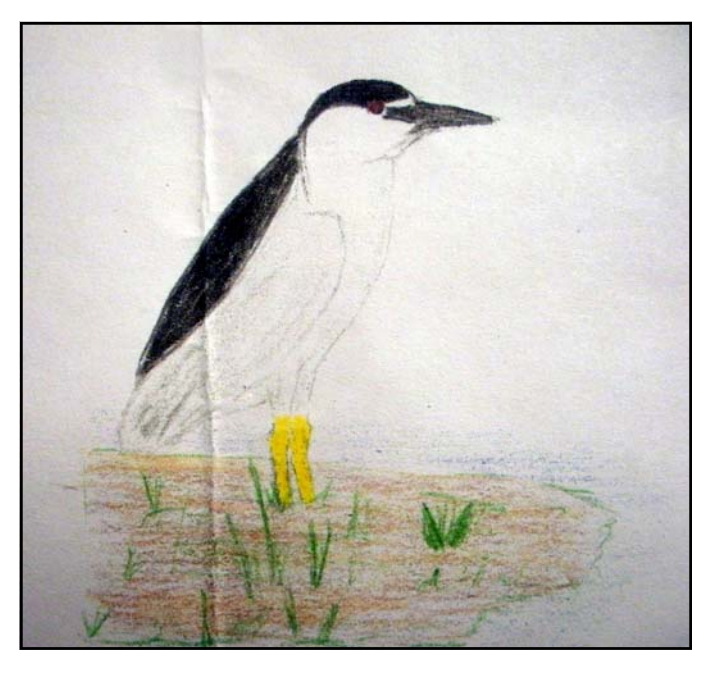
Black-crowned Night Heron