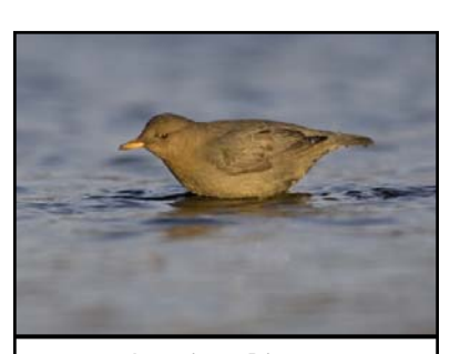
American Dipper