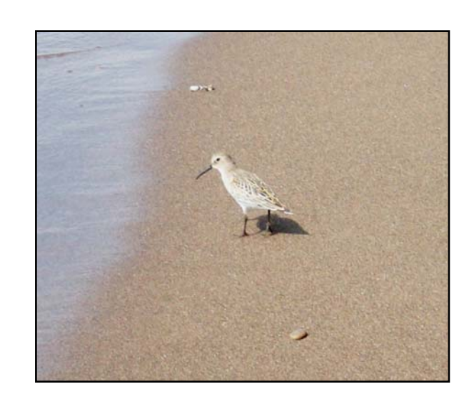
Photo of a Western Sandpiper at Point Pelee, Canada on September 20, 2009