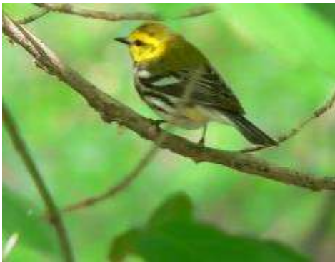
Black-throated Green Warbler by Dakota Outcalt, age 12