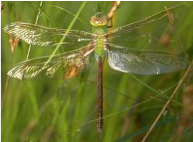
Common Green Darner

Call 419-898-4070 to register or with questions.