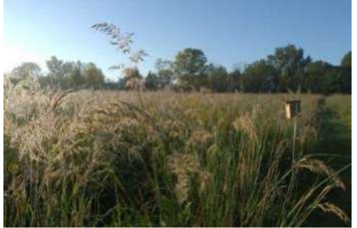
Prairie Rose Farm

OYBC is thrilled to be invited back for a return visit to Prairie Rose Farm, a private nature preserve near Marysville, Ohio, for an overnight campout! The preserve hosts a staggering diversity of life. Highlights will include the awe inspiring spectacle of a huge colony of bats, a nature scavenger hunt, seining in the creek, looking for reptiles and amphibians, and learning about the animals that live on the farm.