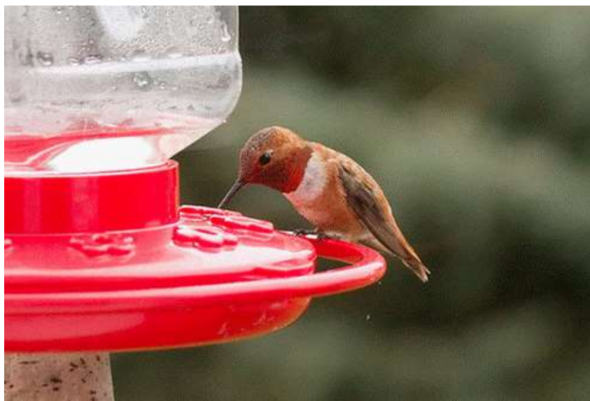
Rufus Hummingbird photographed by the author near Shreve, Ohio.

10,050 and increasing street numbers), I saw a tractor with some Amish people. I asked if they could point out the place to go to, and conveniently found that they were heading for that house. We arrived and waited for about 15 minutes before we saw the Rufus Hummingbird, who, like a large bright bee, buzzed in and landed right on the feeder. Of course, he didn't stay there for long; he just got banded and didn't feel like staying around for a prolonged period of time. He would often land and rest on a